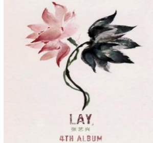
Figure 1 Zhang Yixing "Lotus" Album Cover

other, making it clear what the songs convey. Zhang Yixing's "Lotus" is also an excellent example of a Chinese pop album (Figure 1). On the cover of this album, a traditional Chinese ink painting of a water lily is used, and "Lotus" is meant to represent the uncommon temperament and unruly spirit of the lotus flower that "comes out of the silt and does not get stained" in traditional Chinese culture. The album cover consists of two intertwined black and red lotuses, blooming together, alluding to the concept of "Lotus is born from two sides" (baijiahao 2020). The album cover shows the Chinese character of the music and suggests that the song's main character is the same as the lotus flower. Therefore, a unique album package is attractive to the audience and can enhance consumers' desire to buy (Cheng 2019). Music albums with distinctive features, prominent concepts, and satisfying consumers' aesthetic experiences will catalyze the cross-cultural dissemination of Chinese pop music.